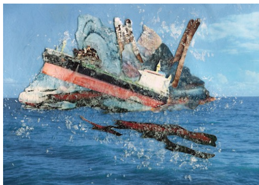
Gayle Chong Kwan, Crysanthi South Africa 2019 , series 'Oil Spill Islands', 2021, collage.

Born in 1973 in Edinburgh, UK. Lives and works in London, UK.