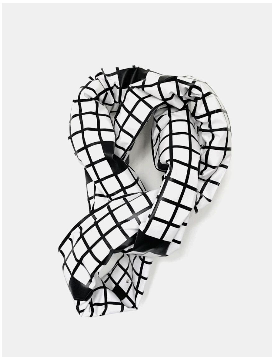
Esther Stocker, Untitled , 2026 Printed PVC, mixed media, 60 x 80 cm, unique