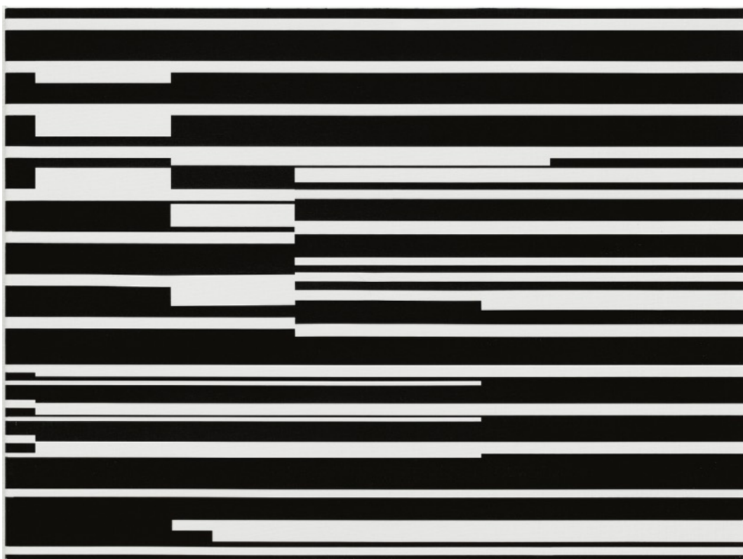
Esther Stocker, Untitled , 2025 Acrylic on canvas, 60 x 80 cm, unique