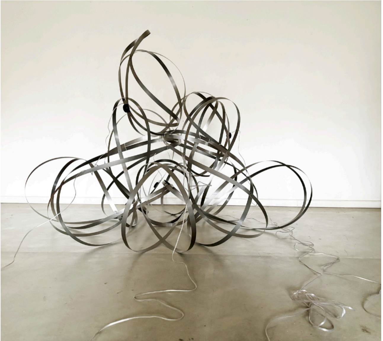
Michelangelo Penso, Magnetic nanoparticles Genesis , 2024, steel and transducers, 178 x 250 x 250 cm.