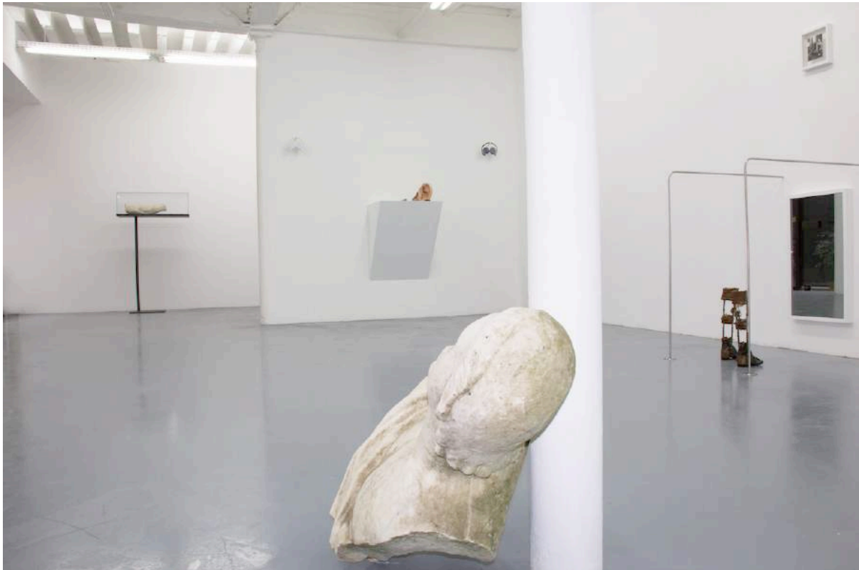
Exhibition view Le monde du ticqueur , 2016, Galerie Alberta Pane