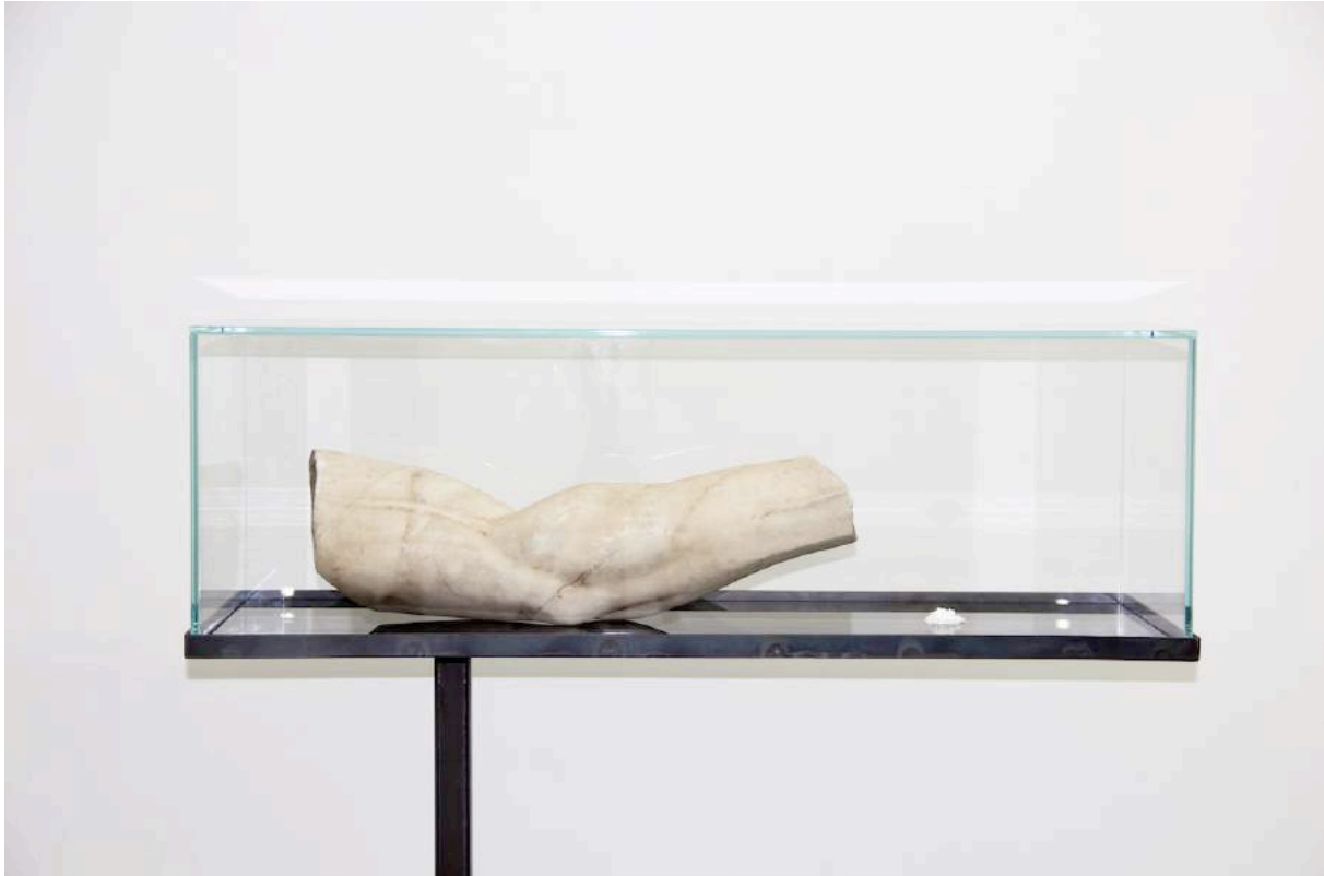
Lithos , 2016