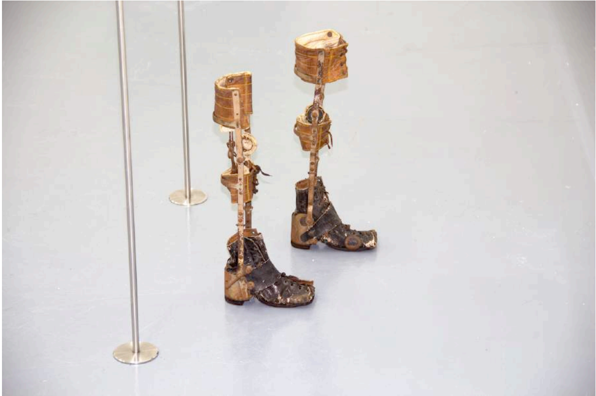
Promeneur , 2016, Installation