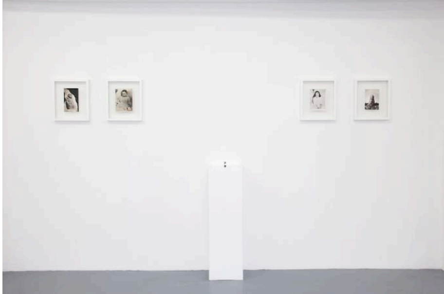
Remember , 2016, installation

This reversal of me into “the other” is also evident in “Fetish” where, in the memory of a mother who’s just lost her child, the identity system is transferred to a puppet. Photographs of Columbian drug traffic victims confront those textile fetishes made by mothers who, with the power of memory, have stitched a physiognomy, have created a new form that needs to replace the one who’s lost.