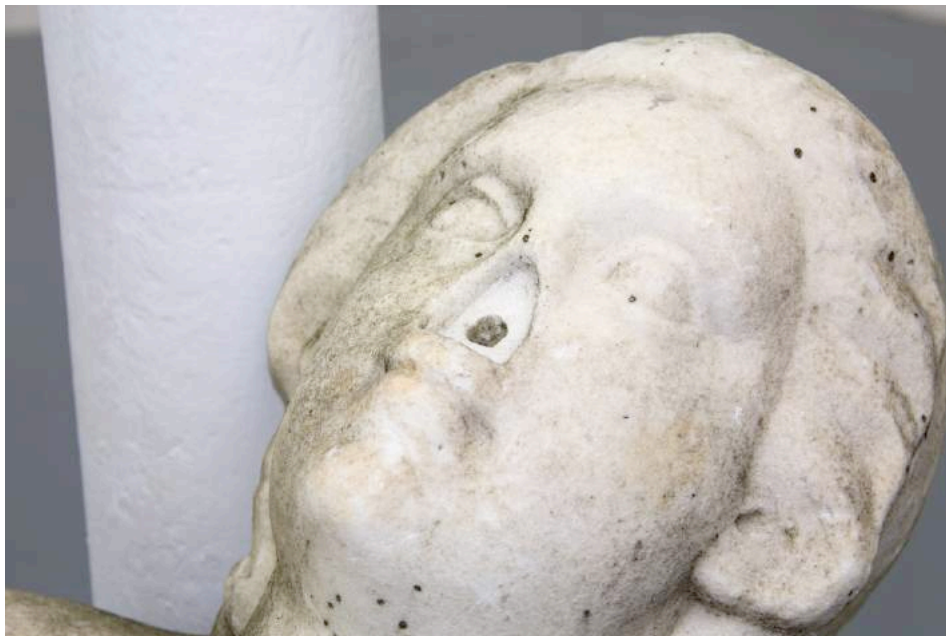
Anosmie , 2016, installation

I always try to see the future with the eyes of the past, I remember the plastic surgeon’s face when I asked him to reconstruct a stone bust’s olfactory system that has been mutilated in the 18 th century. Very probably it was the most absurd demand of his career (“Anosmie”, 2016).