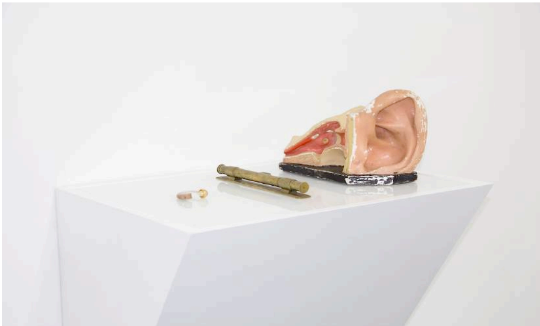
Fantômes de la musique , 2016, installation

"Being an artist", I don't quite know how to define myself; maybe as a researcher who hides, a collector who accumulates, an usurper who protects or a thief who gives. I've always faced the inner urge to search for remains, and to preserve them in a collection. In most cases, I only wanted to keep them for myself, but sometimes I've used them to create new forms and compositions. My master studies at Verona University, when I was "diagnosing" artworks, proved a key moment for the inner change concerning this necessity.