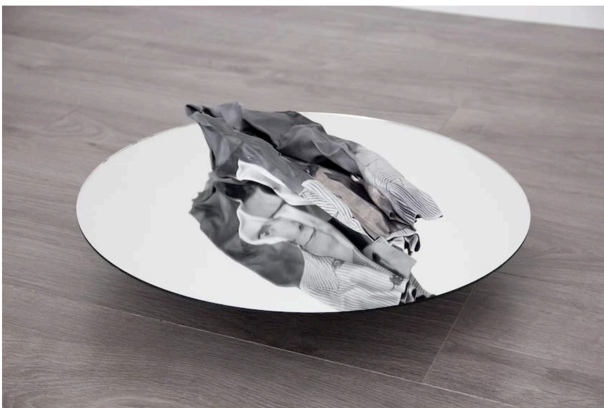
Christian Fogarolli, Amoral , 2015, sculpture, pigment print on lead, mirror, iron, diam: 40 cm