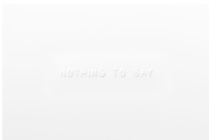
M. Spanghero, Nothing To Say , 2021, engraving on paper, 29,7 x 42 cm