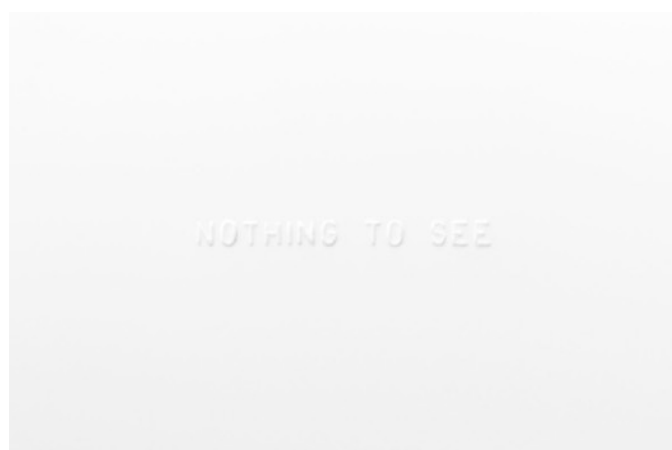
M. Spanghero, Nothing To See , 2021, engraving on paper, 29,7 x 42 cm