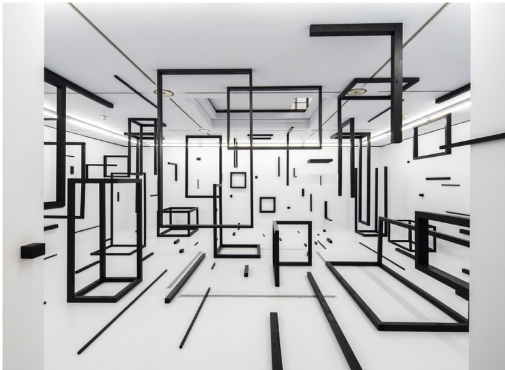
Esther Stocker, Site specific installation, 2020, Museum für Konkrete Kunst, Ingolstadt, Germany