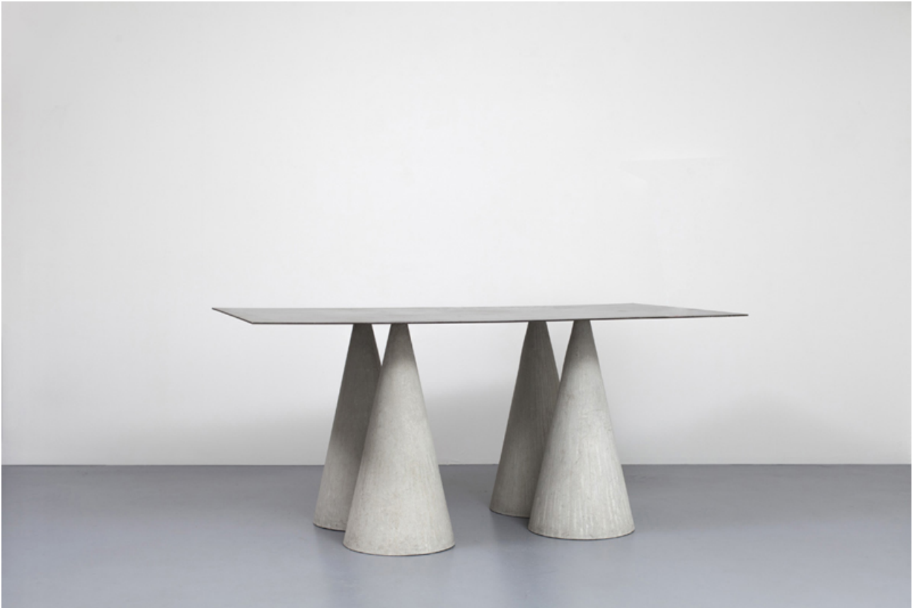
Benjamin Baltimore, table bureau, pièce unique 1982