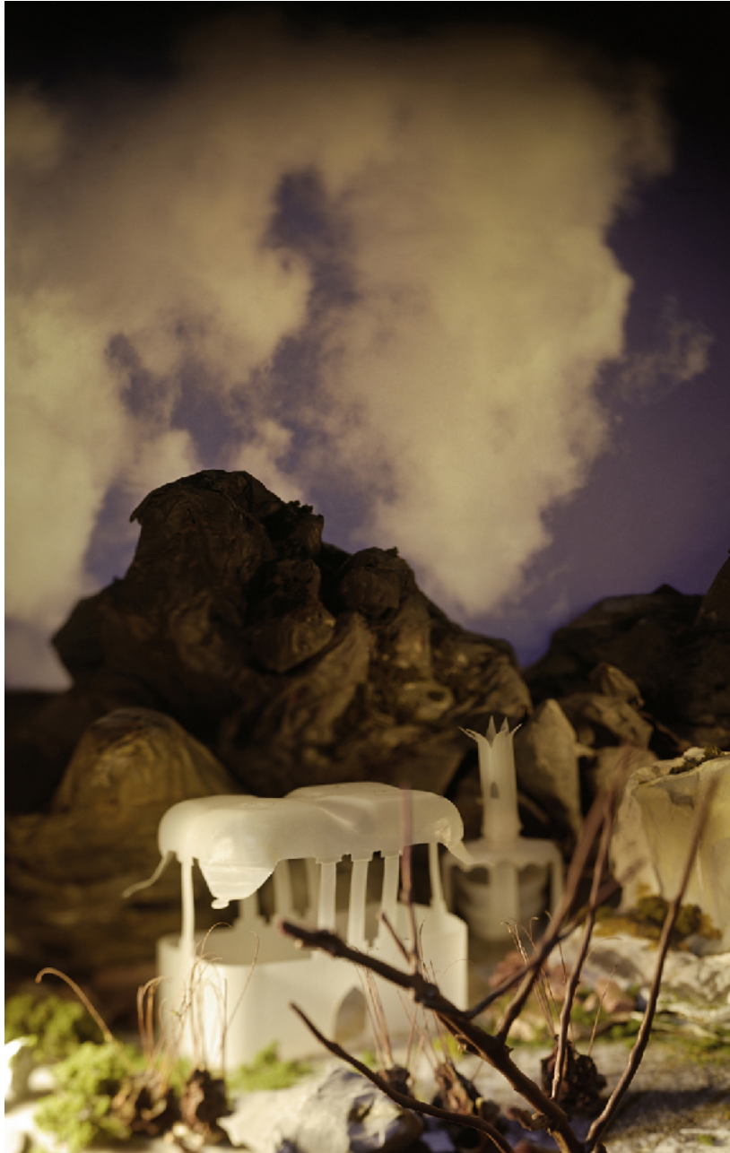
Gayle Chong Kwan The Land of Peach Blossom 2008 C-type print