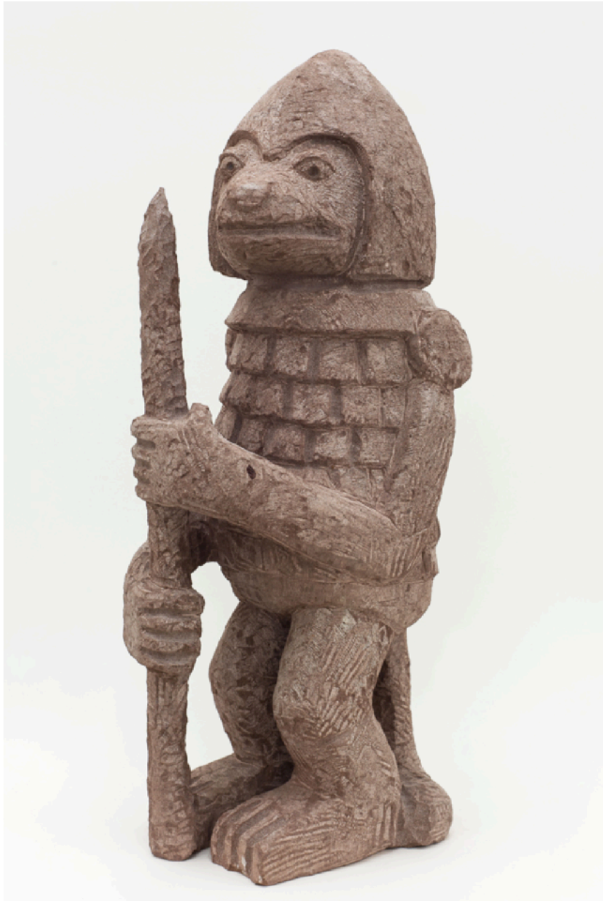
Stefan Rinck Claimstaker, 2013 Grès 66 x 28 x 22 cm