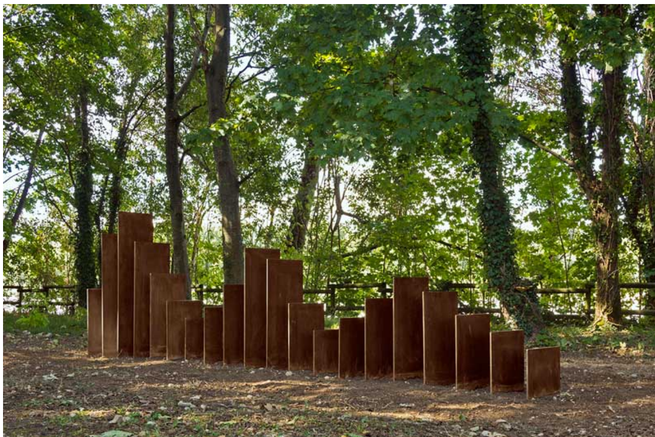
Wave , 2017 iron, concrete (dim. 480x150x40cm) permanent installation @ Isonzo Park, Turriaco (I)