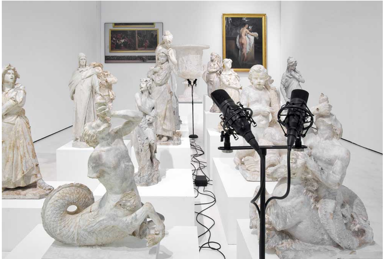
Audible Forms , 2013

modified microphones, stands, cables, audio system (variable dimensions, dur. 8' loop) and statues (by A. Malfatti) installation view @ MaRT, Rovereto (I), 2013