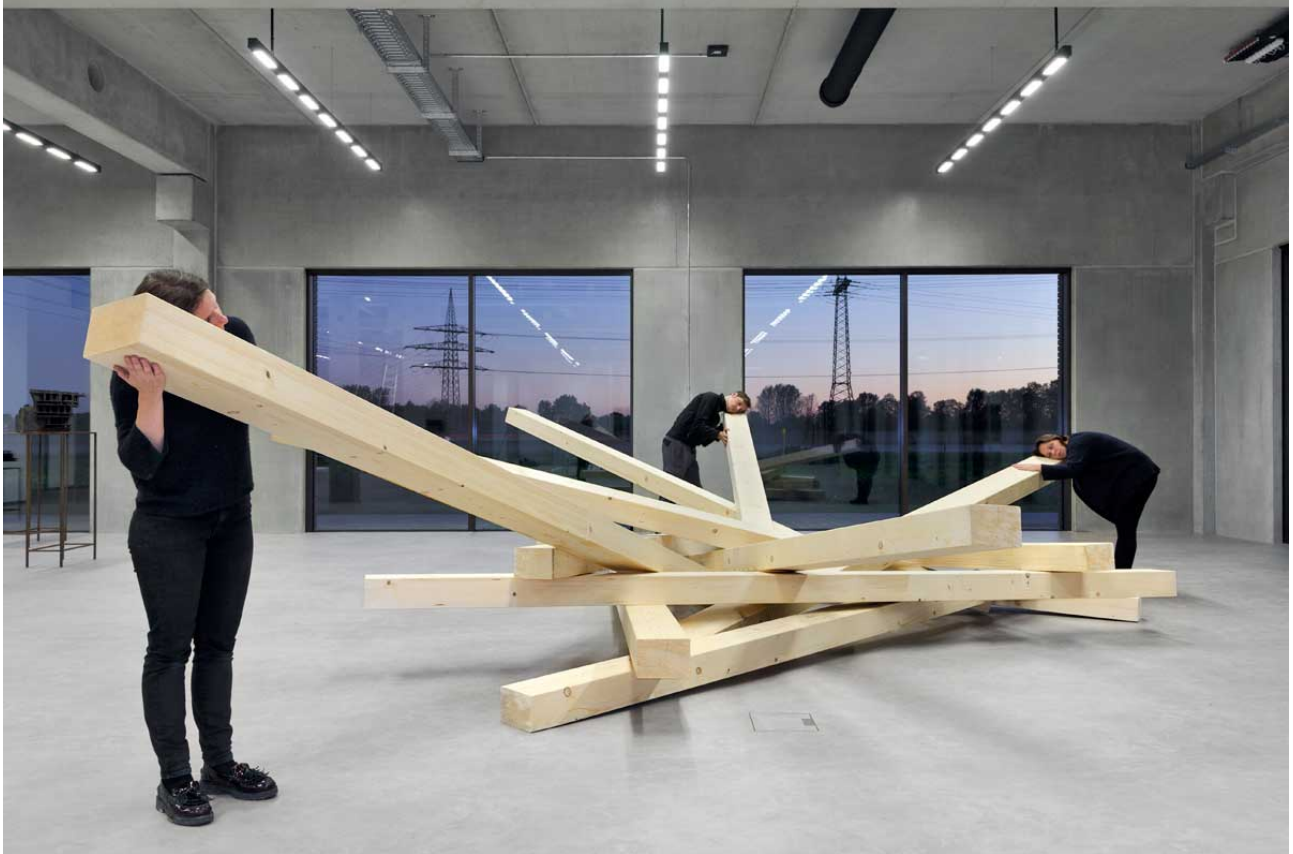
Listening Is Making Sense , 2017 12 wooden beams (12x20x430cm each) transducers, audio system (variable dimensions - 68min. loop) exhibition view @ Sammlung Finstral, Friedberg (D), 2017