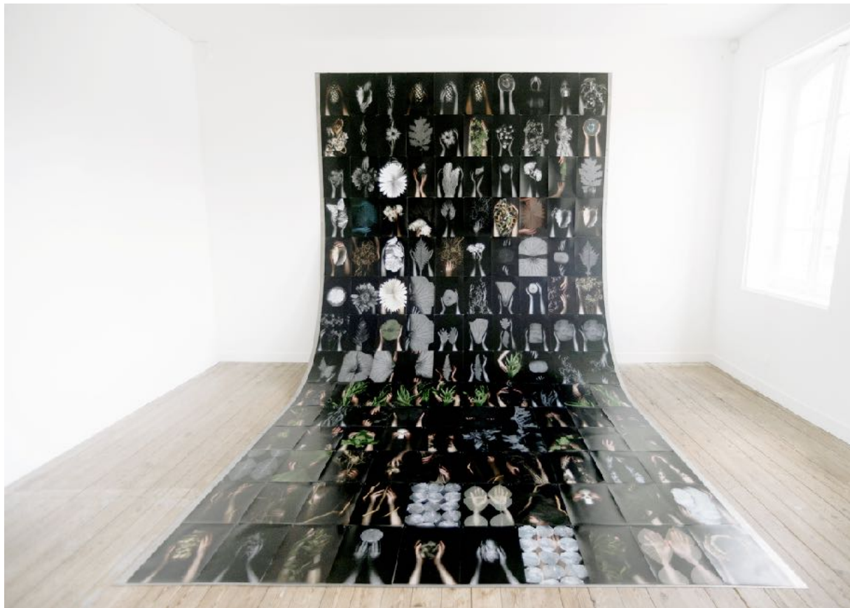
L'herbier lacustre, herbier de curiosités 2019 160 tirages sur papier couché 100g aimantés sur rampe acier sur mesure 41 x 29 cm chacun