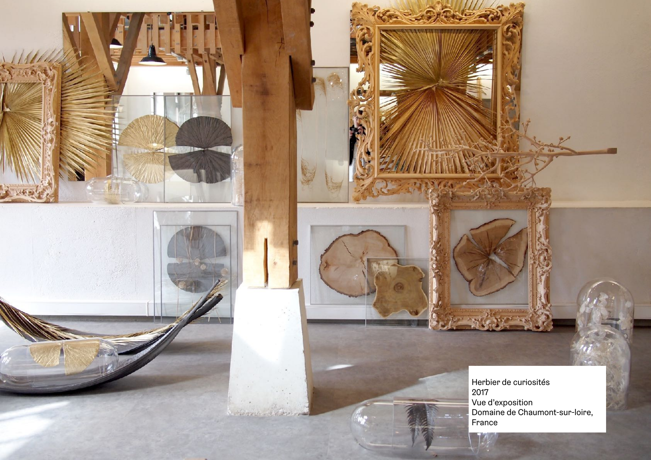
Herbier de curiosités 2017 Vue d'exposition Domaine de Chaumont-sur-loire, France