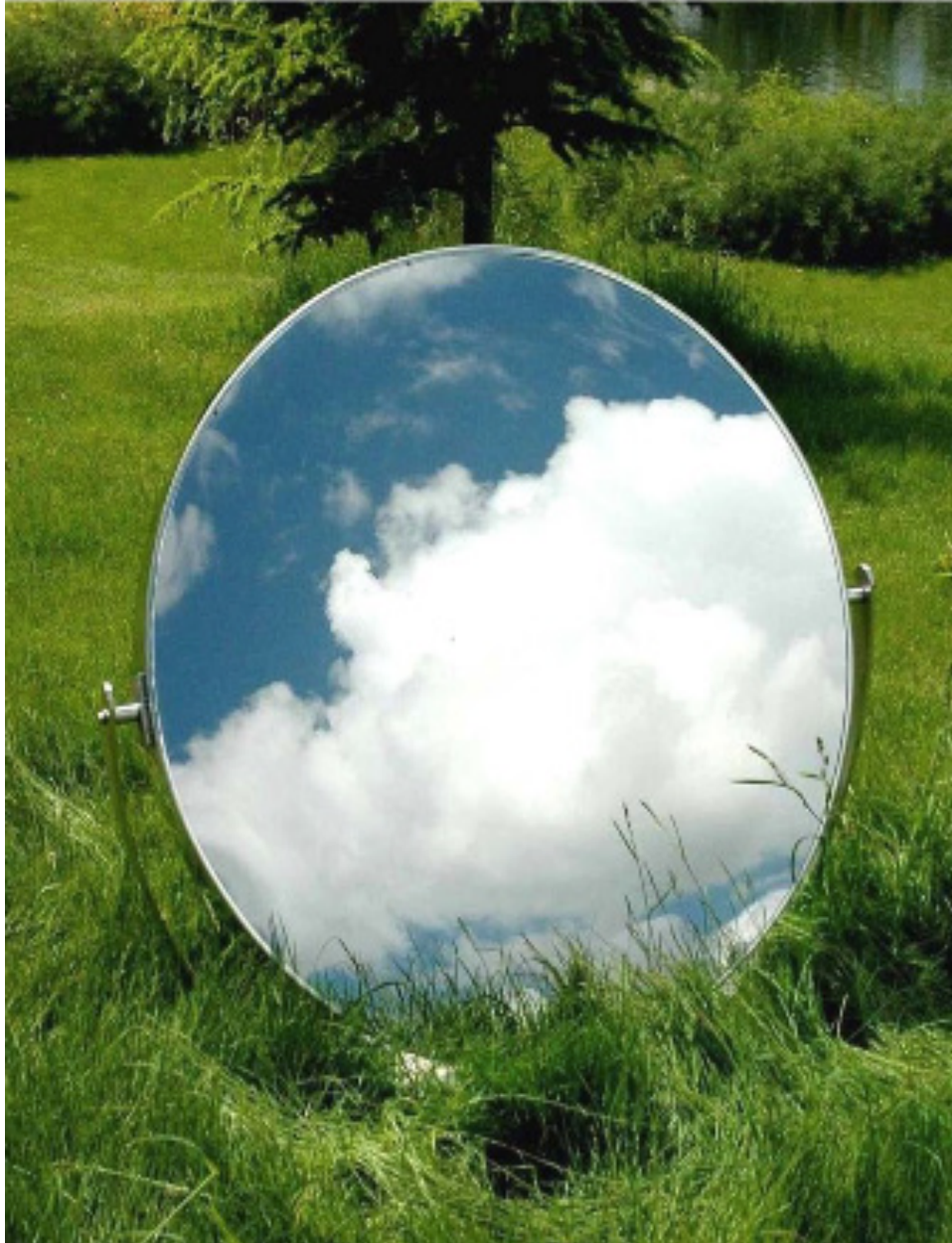
“La Psyché”, 2006 Domaine départemental de Chamarande, Essonne, France