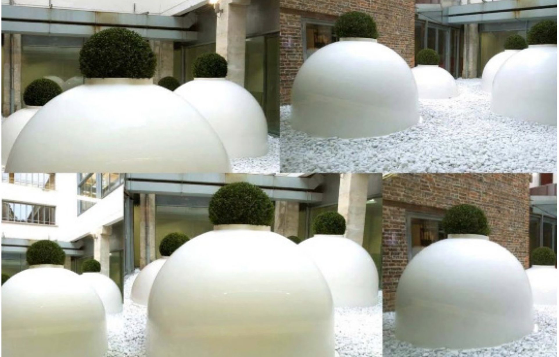
I giardini di Marzo , 2008 Patio de la Maison Rouge, Fondation Antoine de Galbert, Paris, France