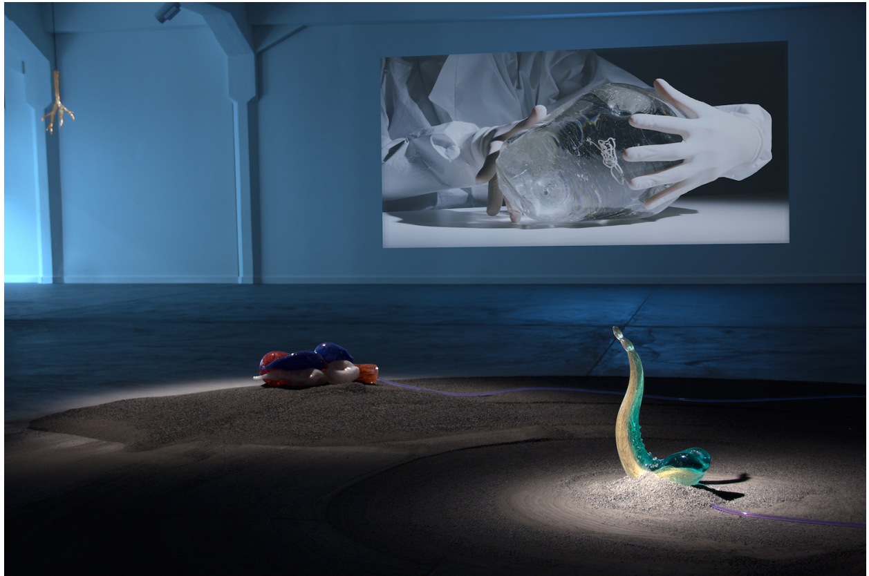
Pneuma , 2020, exhibition view, Löwenbräukunst Contemporary Art Center, Zürich.