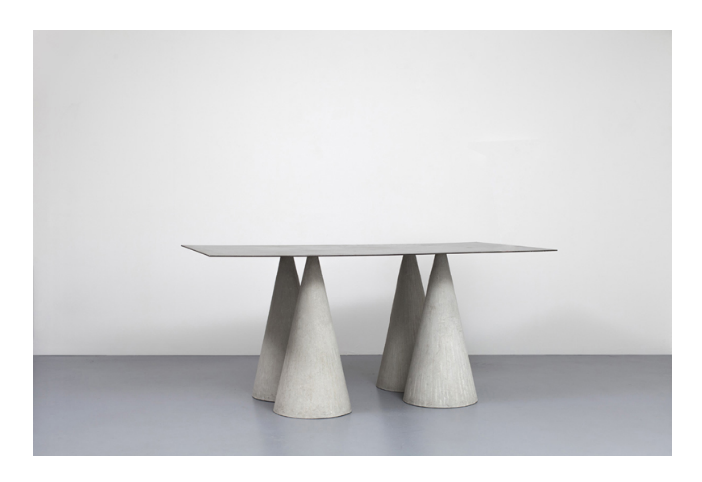
Benjamin Baltimore, table bureau, pièce unique 1982