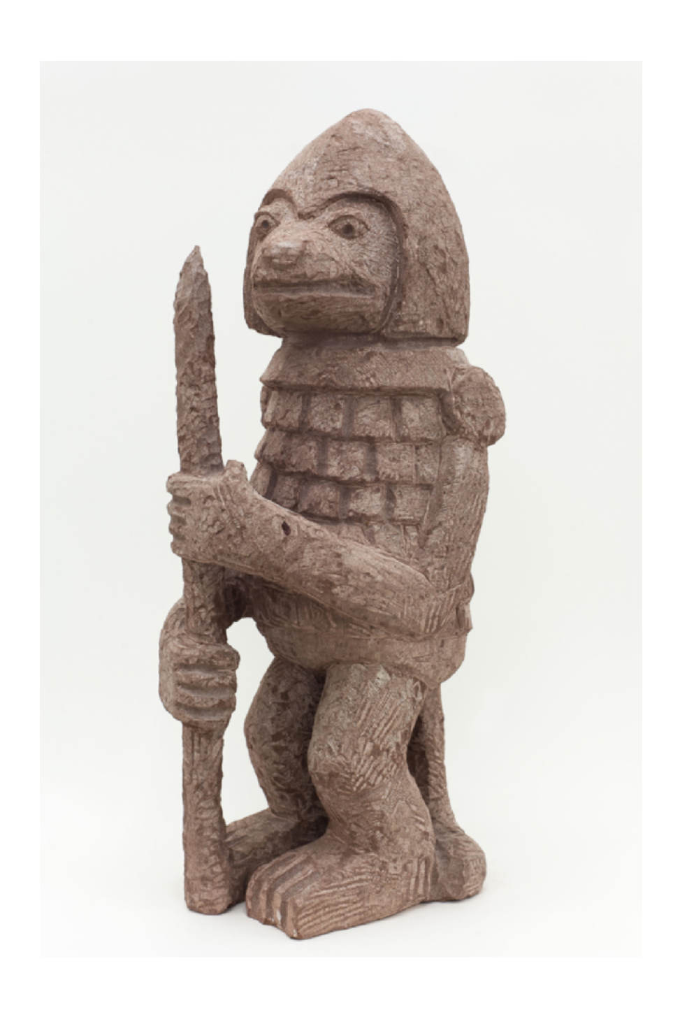
Stefan Rinck Claimstaker, 2013 Grès 66 x 28 x 22 cm