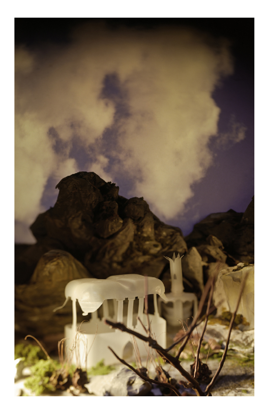
Gayle Chong Kwan The Land of Peach Blossom 2008 C-type print