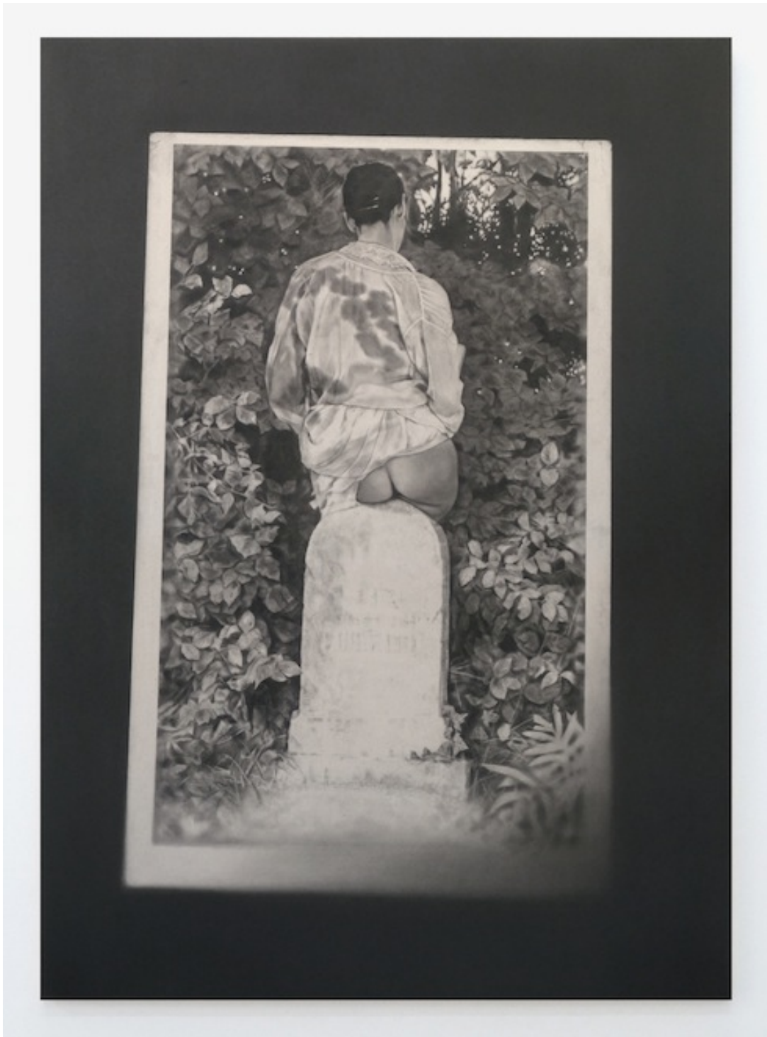
Foi dans la messe , 2015, drawing, pierre noire on grey cardboard, 140,5 x 101 cm