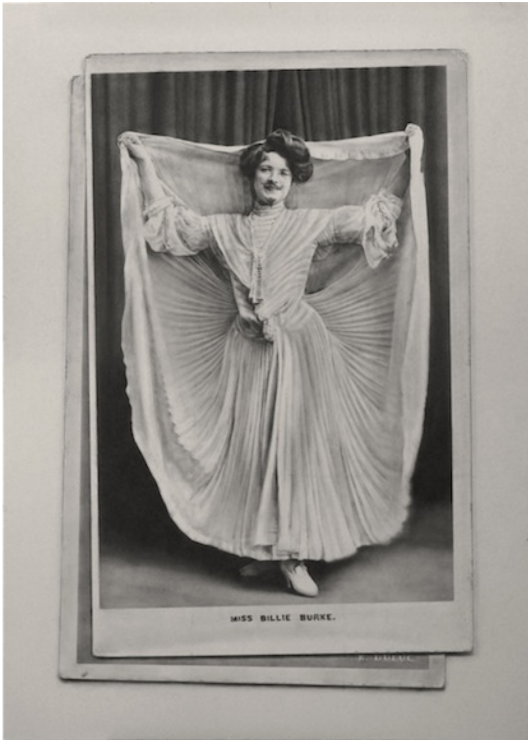
L'ancien coût des cures tisanes , 2015, drawing, pierre noire on grey cardboard, 141 x 101 cm